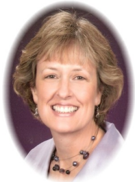
From Our Senior Minister